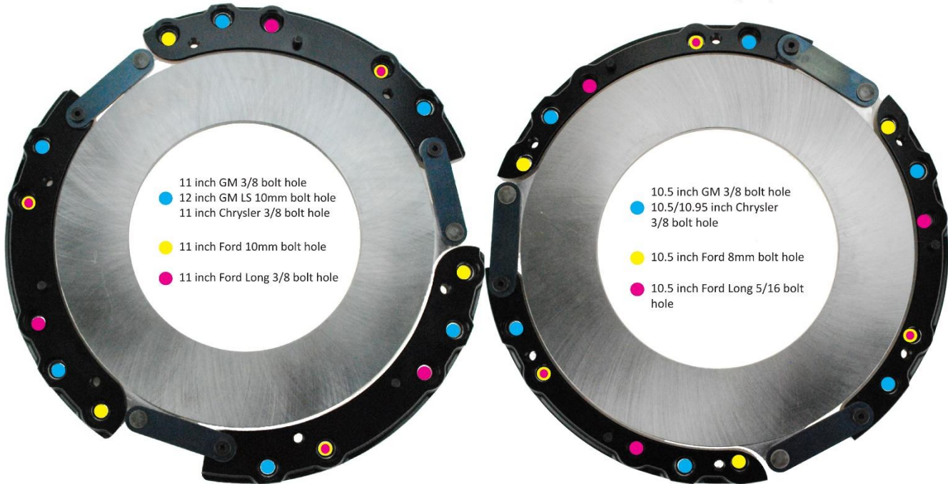
10.5 inch stand mounting configurations