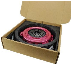
Concept 10.5 unit in box

Remove the clutch system from the box. Remove the 6 – M8 bolts that retain the pressure plate to the modular stands and lift the pressure plate and top disc. DO NOT unbolt the 3 bolts that retain the floater plate to the stands.