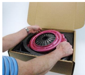
removing assembly from box