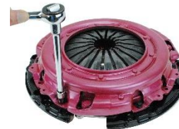
Removing 6 – cover bolts