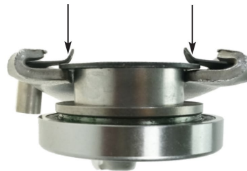
Incorrect installation - clips around rear of bearing